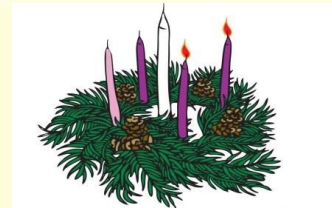
Second Sunday of Advent

A warm greeting is extended to all who have come to worship with our community of faith. We are grateful for our faithful parishioners who are here every week. We also welcome all our visitors and invite you to consider joining our parish. If you are not Catholic, we encourage you to contact our Parish Office for information about becoming a member of the Church.